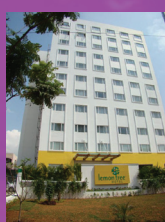
LEMON TREE GUINDY