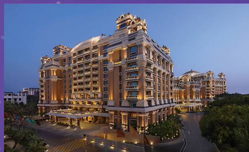
ITC GRAND CHOLA

Please book your accommodation at the venue at the special rates available exclusively during the conference. Kindly book your room at the earliest, as only a limited number of rooms are available. For Venue - (Link will be provided)