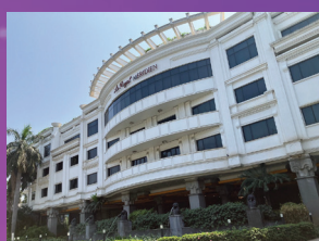
LE ROYAL MERIDIAN